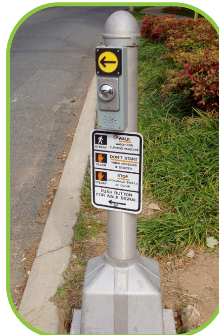
► Push Button Crosswalk