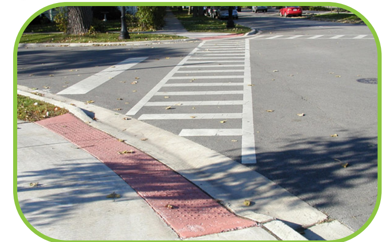
► Sidewalk with Detectable Warning Surface