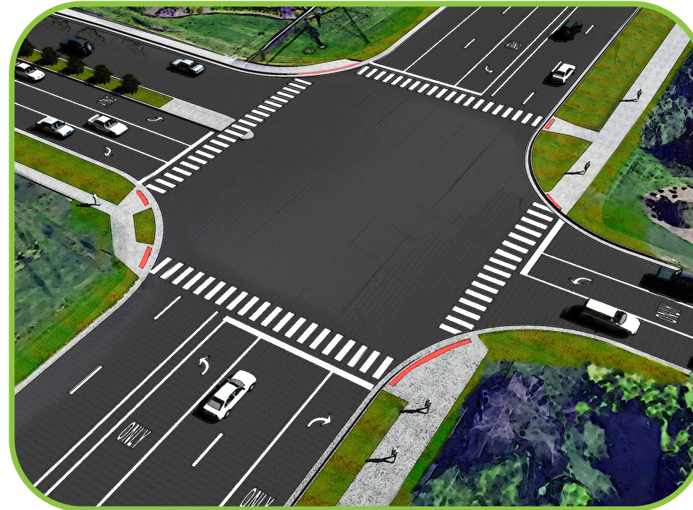
► Traditional Signalized Sidepath