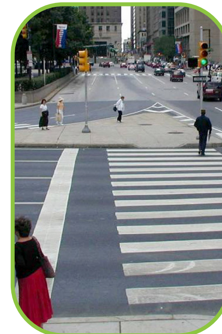
► Intersection Traffic Control Island