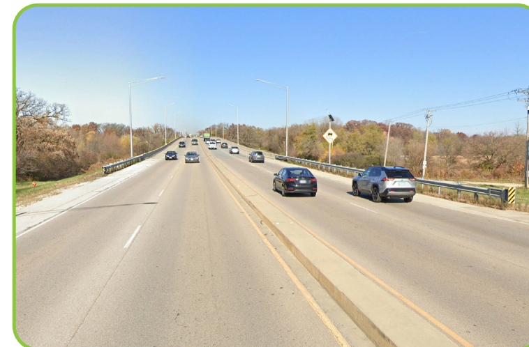
➤ Claude Hanson Bridge: No Pedestrian or Bicyclist Path