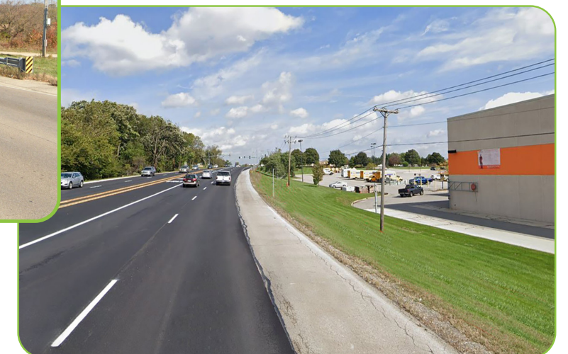
➤ No Bike Path