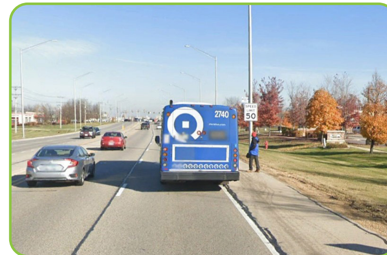
➤ PACE Bus Stop Without Connectivity or Shelter