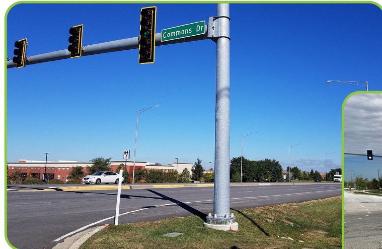
➤ Traffic Signal Without Crosswalk