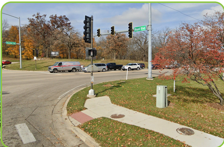
➤ Sidewalk Without Connectivity